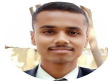
Harsh Sao AIR 312 (Pune)